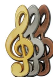
MUSICAL CLEF BADGE

In addition to those listed above, we also have end of term celebration assemblies where prizes and certificates are awarded.