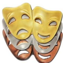
DRAMA MASK BADGE

Finally, termly, two pupils per subject for each year group will be awarded our subject specific lapel badge to wear with pride. The winners of these awards will have demonstrated the highest of standards and will be selected by department areas.