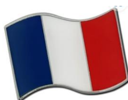
FRENCH FLAG BADGE