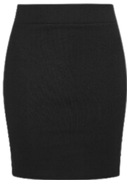
Tube skirt / tube-style skirt from any provider