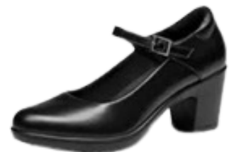
Shoes with a high heel

Shoes MUST NOT have any visible sports branding, such as Nike, Adidas, Converse, Vans or On Cloud.