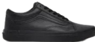
Vans Trainers (or any plimsoll or trainer-style shoes)