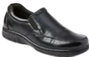
Formal school shoes without laces