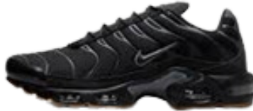
TN Air Max (or any trainer-style shoe)