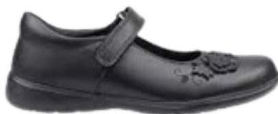
Single strap school shoe