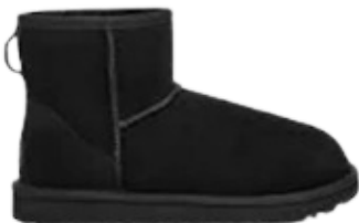
Uggs (any style) or any other boots