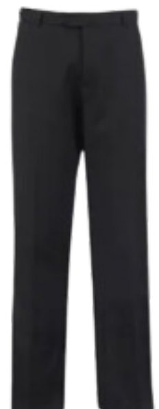
Plain, relaxed fit, full-length trousers