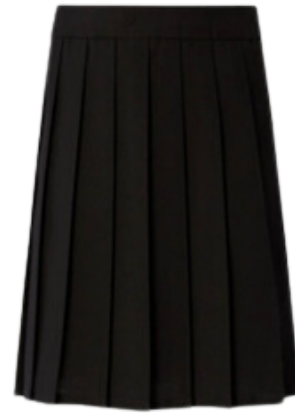
Knee-length, full permanent pleat

Skirts that DO NOT adhere to our school uniform policy: