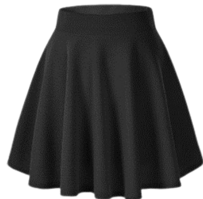
Skater-style skirt from any provider