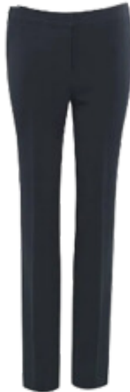
Plain, regular / tailored fit, full-length school trousers