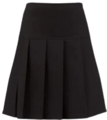
Knee-length, drop waist, permanent pleat