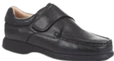
Formal school shoes with Velcro