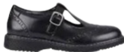
Leather T-bar shoes