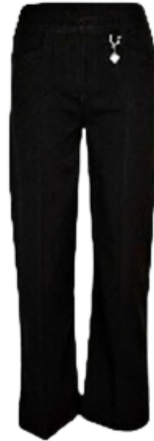
Trousers (any style) with any metal decorations or metal zips