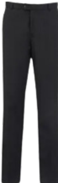
Plain, slim fit, full-length trousers