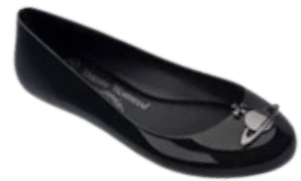
Pumps (any style) (e.g. Vivienne Westwood x Melissa)