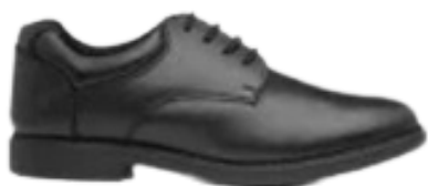
Formal school shoes with laces