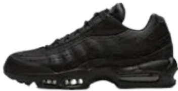
Air Max 95s (or any style of Nike Air Max)