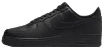
Nike Air Force I