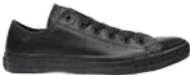
Leather or fabric Converse (or any plimsoll or trainer-style shoes)