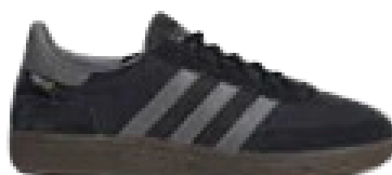
Any all-black trainers (i.e. not traditional shoes)