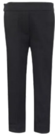
Plain, relaxed fit, full-length trousers

Boys' trousers that DO adhere to our school uniform policy: