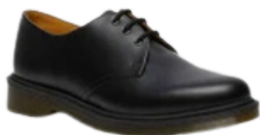
All-black DM shoes (plain black stitching)