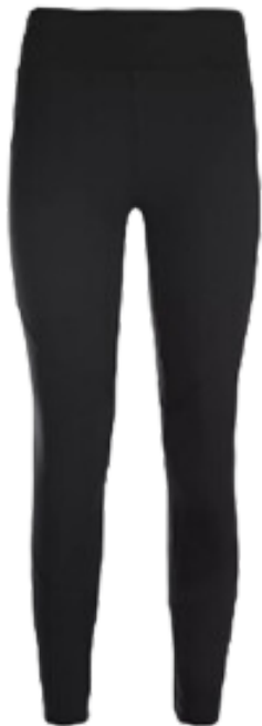
Leggings / jeggings of any description