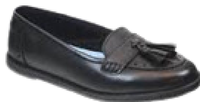
Leather loafer (no branding)