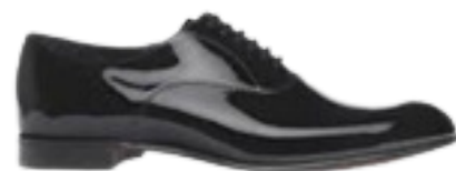
Patent leather shoes

This is to provide an example. There will be other formal, polishable school shoes available from retailers that meet school requirements.