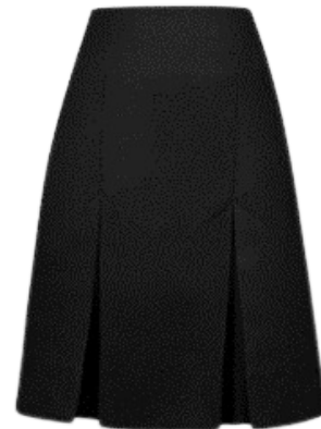
Twin pleat skirt from any provider