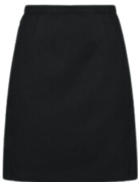
A-line school skirts from any provider