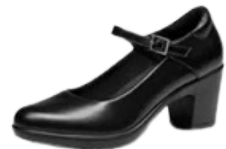
Shoes with a high heel

Shoes MUST NOT have any visible sports branding, such as Nike, Adidas, Converse, Vans or On Cloud.