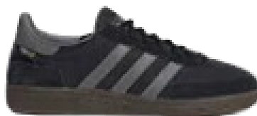
Any all-black trainers (i.e. not traditional shoes)