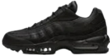
Air Max 95s (or any style of Nike Air Max)