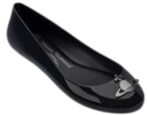
Vivienne Westwood x Melissa pumps (all)