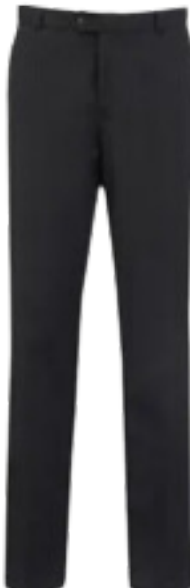
Plain, slim fit, full-length trousers