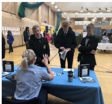
Next Steps Live Event

Some of our year 11 pupils were given the opportunity to attend the above event on 21 st October. Pupils were invited to explore their careers and training opportunities, meet employers currently hiring and build their future at Your Next Steps Live.